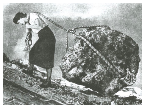
Grete Stern Dream 15, 1949

(Just to be clear - the illustration is an editorial comment, and does not represent Jay's sentiments!)