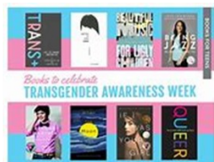
Trans books and media

https://online.fliphtml5.com/dchey/wwce/?fbclid=IwAR3uxMI9bxQO9FmjVJTzd571ARUNRPNiLJBfxbd2bi_sLeXkUVqjJPzwk_A#p=26