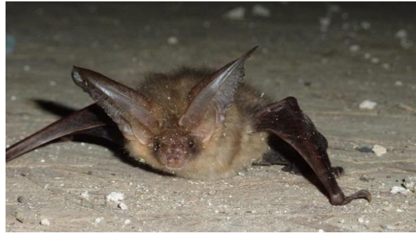
Brown Long-eared Bat

My interest in mammals developed over the years and I have spent many hours watching badgers and bats, both nocturnal beasts, which means you are out when most others are either tucked up watching television or in bed but the peace and quiet plus watching the antics of these beautiful beasts makes the loss of sleep worthwhile. I also act as an expert witness as sadly badgers and bats are often treated badly by people. Badgers are still used for badger baiting for example, with bets being placed on which dog will win the fight. So, whilst I may not be leading protest marches for climate change, I do my bit other ways.