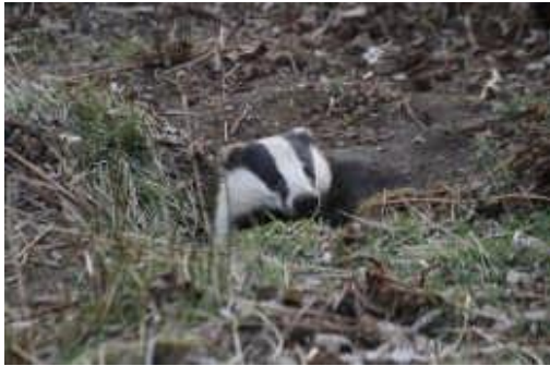
Badger emerging from sett