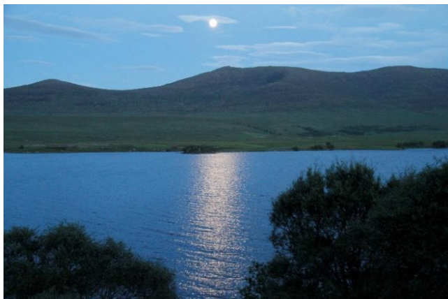
Moon rising over Loch Naver

As I said earlier, I look on the vastness of the world as a church in itself, and can be equally as happy praying out in the wild as I am sitting in a pew in the most magnificently decorated cathedral as to me they are one and the same, they are just decorated differently. You may find bleak times, but always remember, that there is hope, and prayer can be very therapeutic and you can pray anywhere and at any time.