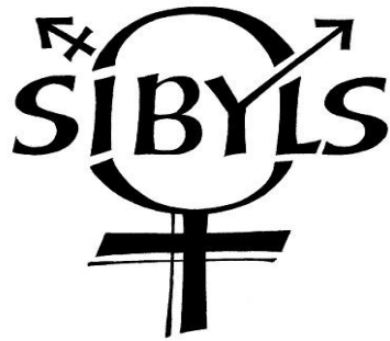
SIBYLS LOGO - ROBYN GOLDEN - HANV 28 MAY 2018